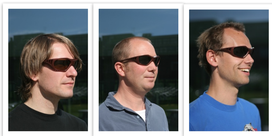
Customized sunglasses made for three different persons